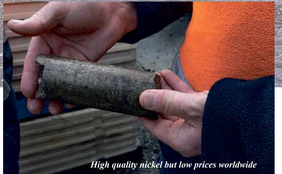
High quality nickel but low prices worldwide